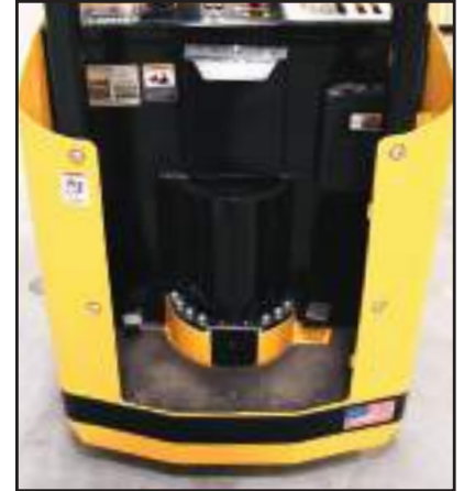
Low Step Height Operator Rear Entry

Landoll Stand Up Ride Compact Electric Lift Truck