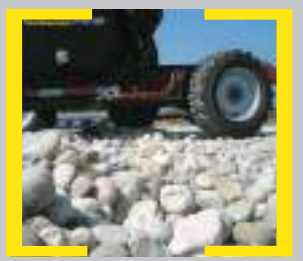
No counterweights on tires.