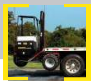
Shortest truck-mount overhang per model in the industry – making it easier, safer to transport. Light weight (plus a center of gravity moved closer to the truck axle) puts less stress on the truck or trailer, and allows more payload.