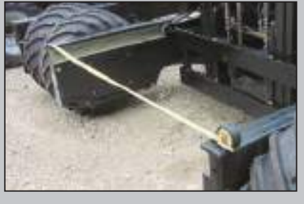
Width & frame opening: 98" (wide) using 31"x15.5" tires, 59" frame opening (All models except CR 45 – see specifications)