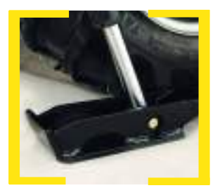
Large stabilizer pads that lower straight down (vs at an angle) give a more stable footing and allow the CRAYLER to move-in closer for the lift. Actually operates wheel-to-wheel with the truck – to load and unload materials! The cylinders retract into the frame – don't get caught-up on curbs or rough terrain.