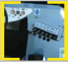
4-way mode enabled via hydraulic