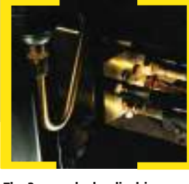
The 3-pump hydraulic drive system (All models except CR 45 – see specifications) allows wheels, mast and steering to operate independently – enabling the CRAYLER to power itself out of deep mud or sand... without stalling! A hydraulic oil cooler extends the life of oil seals – ensuring long operating service without losing performance.