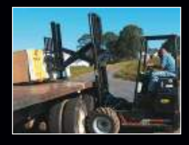
Lift capacity is 5000 lbs. at 24" load center