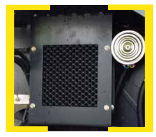
Hydraulic oil cooler extends the life of oil seals. Operates longer without losing performance. (All models except CR 45 – see specifications)