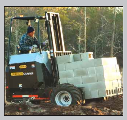
Synchronized 3-wheel drive – all three tires the same size and rotation speed – means less wheel spin, improved climbing and rough terrain capabilities. Twin-lock wheel motors deliver more power to the ground. No need to rev-up!