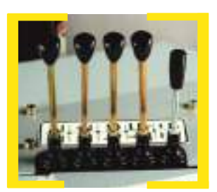
Controls are in front of the operator and the foot area is large with plenty of legroom.