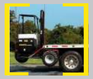
Truck-mount overhang of 52"