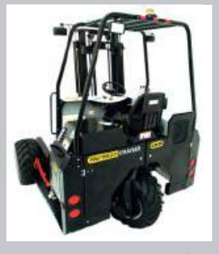
Crayler CR 45 is the entry level for PALFINGER'S Truck Mounted Forklifts. Most of the specifications are the same as the CR 50 & 55 except for a few features; The 47 HP 3 cylinder diesel engine, a 2 pump hydraulic system and the truck-mount overhang of 52".