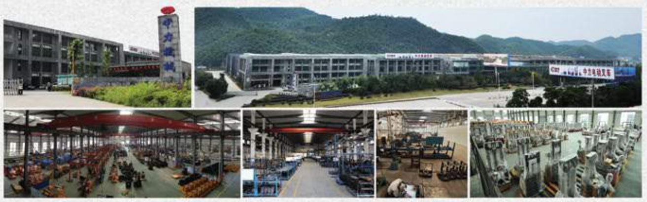
REDDOT believes in customer driven design and has developed hundreds of models to meet specific customer and industry applications. Thanks to a great team, cutting edge product design and industry leading manufacturing processes REDDOT achieved top Class I/II/III market share in 2013 (in units) in China and will produce over 20,000 units in 2014.