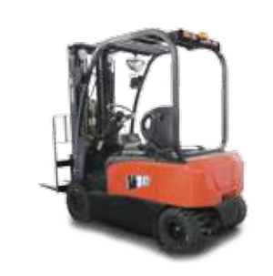
J series CPD40/45/50/60/ 70/80/85J 4.0/4.5/5.0/6.0/ 7.0/8.0/8.5T