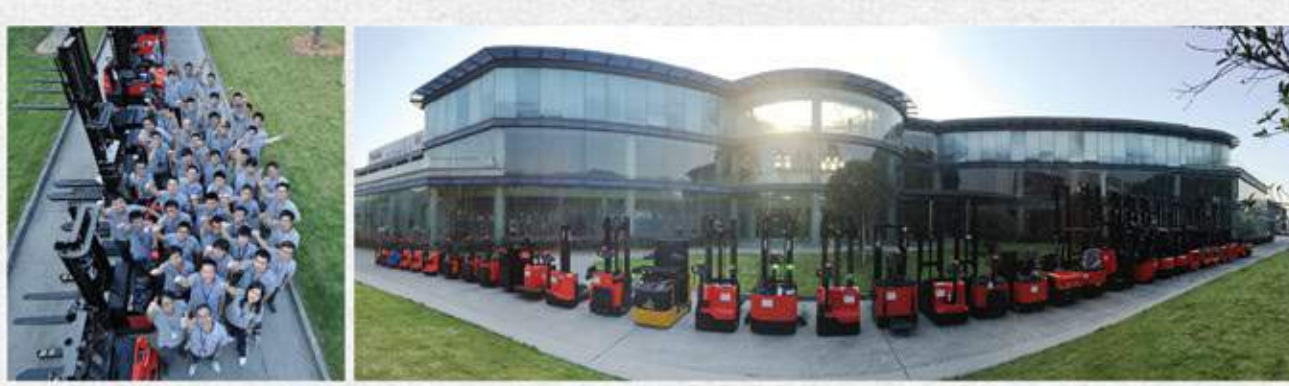
Innovation is the key driver of REDDOT's success. REDDOT has a global engineering team of nearly 100 people and believes in a relentless focus on customer driven design.